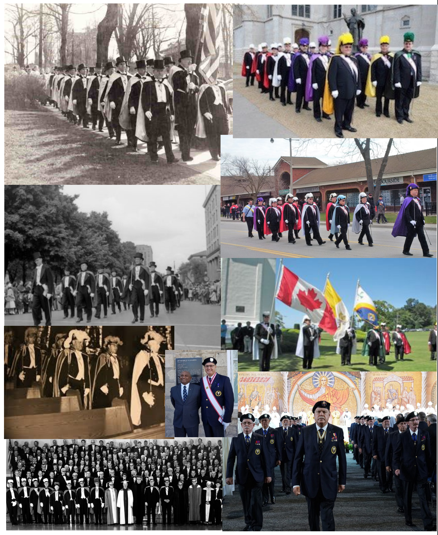
Did you know that the first Fourth Degree Exemplification was held in Montreal, Quebec on July 14, 1907.

The evolution of the 4th Degree regalia.